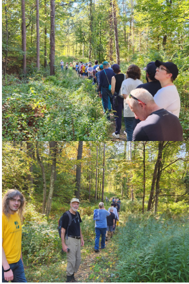
25th Anniversary Hike