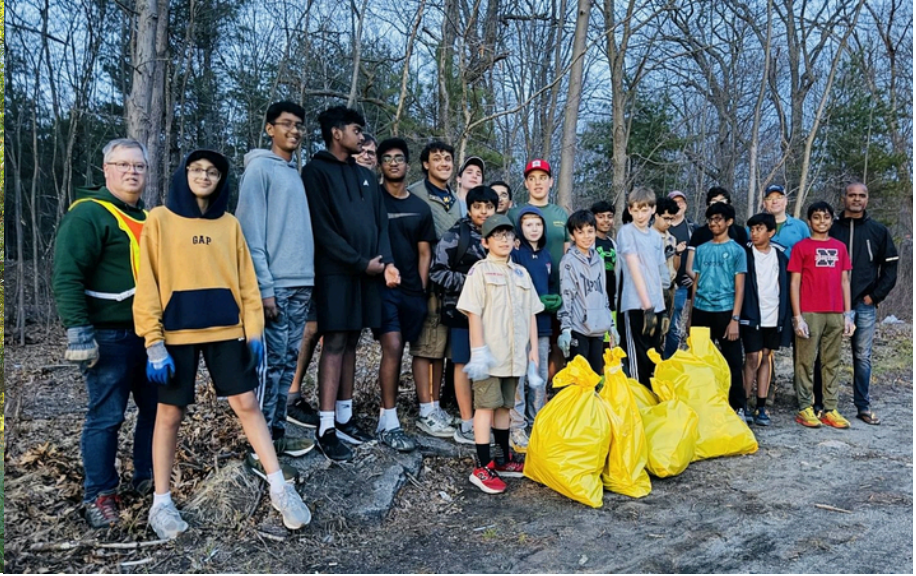
April's Litter Clean Up

Education Committee had another full year of events.