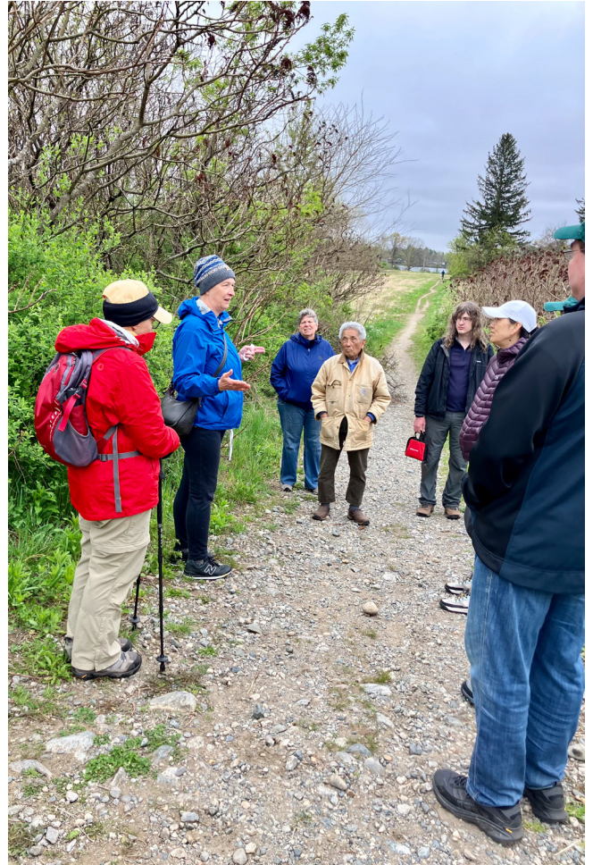
Nature hike for Westborough Unplugs week.