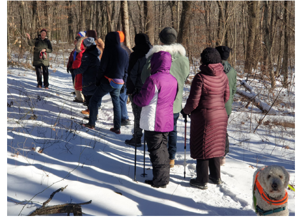
Wildlife App Walk, Earth Day Litter Cleanup, and Despres Property Winter Walk, three events put on by the Education Committee.