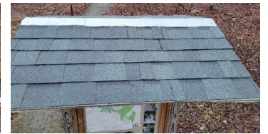
New Roofs on the kiosks at Mill Road and Gilmore Pond kiosks (before and after pictures)