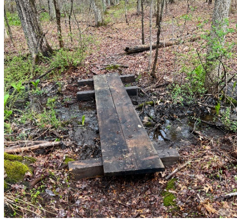
Several bridge sections were installed in the Indian Pond property.