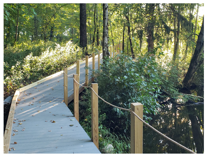
Gilmore Pond Trail