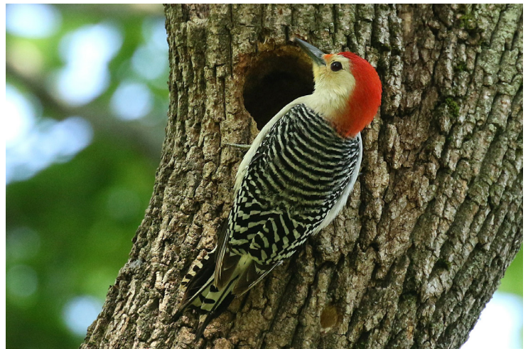
A red-bellied woodpecker at its nest hole

At the March 2022 Annual Town Meeting the townspeople considered and voted to place adoption of the Community Preservation Act (CPA) on the November 2022 ballot. Read about the Town Meeting vote here: https://www.communitypreservation.org/home/news/ cpa-adoption-update-westborough-first-november-2022-ballot. Additional information regarding the CPA proposal for Westborough may be found at: <u>https://</u> www.town.westborough.ma.us/sites/g/files/vyhlif5176/f/ uploads/cpaec recommendation report final.pdf. If