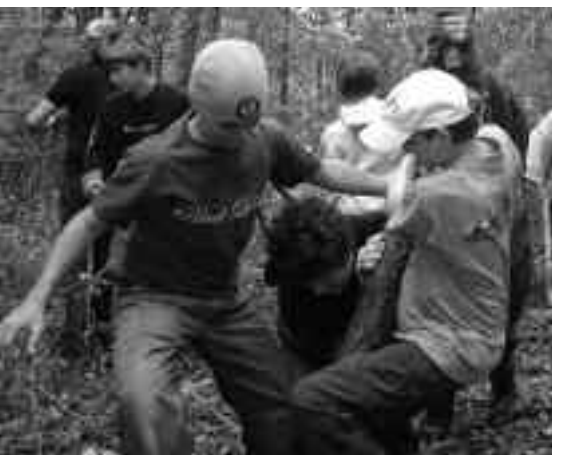
As part of Gilmore Pond's restoration, Troop 4 Boy Scouts work with Civic Club and WCLT members to clear invasive species.