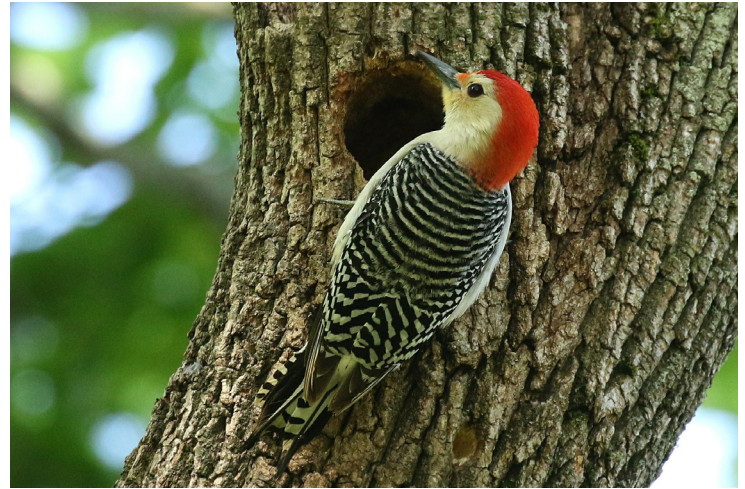
A red-bellied woodpecker at its nest hole

At the March 2022 Annual Town Meeting the townspeople considered and voted to place adoption of the Community Preservation Act (CPA) on the November 2022 ballot. Read about the Town Meeting vote here: https://www.communitypreservation.org/home/news/cpa-adoption-update-westborough-first-november-2022-ballot . Additional information regarding the CPA proposal for Westborough may be found at: https://www.town.westborough.ma.us/sites/g/files/vyhlf5176/f/uploads/cpaec_recommendation_report_final.pdf . If