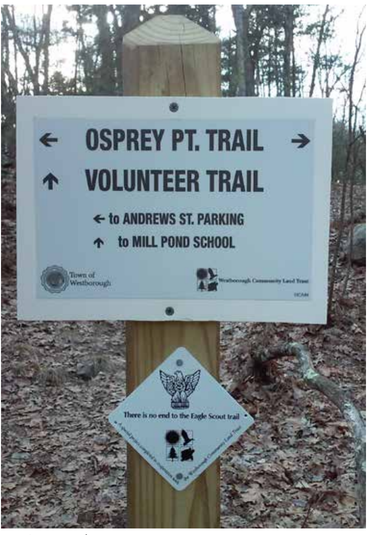
Boy Scout Eagle Project sign